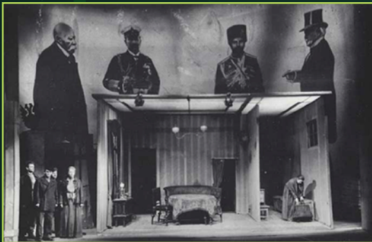
John Heartfield set for Bertolt Brecht's Die Mutter ( The Mother ), 1951, Cygnet Theatre.

In The Motion , the audience plays an active role in the story, a technique which is central to the tradition of epic theatre. Popularized by German playwright and director Bertolt Brecht, epic theatre is a form of theater that aims to engage with the audience through commentary and discussion, often used to explore social and political issues. A key feature of epic theatre is the “alienation effect,” that emotionally distances the audience from the play so they can consider the work’s themes objectively. One common example of the “alienation effect” is breaking the fourth wall, in which actors directly address the audience, disrupting the imaginary boundary between the stage and the audience. Rather than following a linear plot or showing strictly realistic scenarios, epic theatre constantly reminds the audience that they are watching a play.