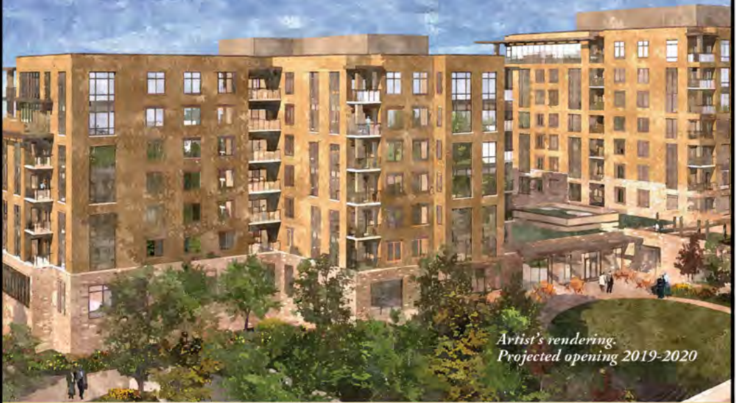
Artist's rendering. Projected opening 2019-2020