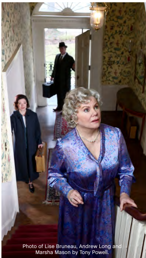
Photo of Lise Bruneau, Andrew Long and Marsha Mason