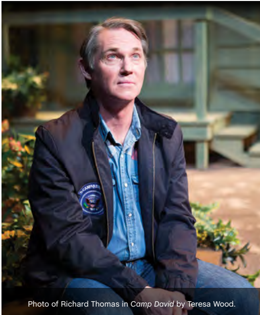
Photo of Richard Thomas in Camp David.

Give online at arenastage.org/donate or by calling the Development Office at 202-600-4177.