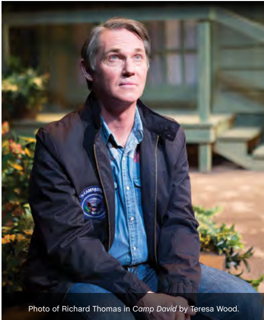
Photo of Richard Thomas in Camp David.

Give online at arenastage.org/give or by calling the Development Office at 202-600-4177