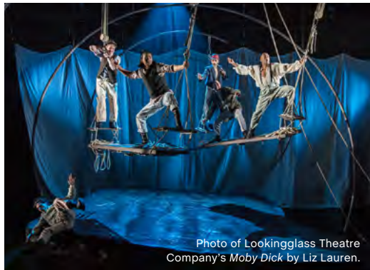
Photo of Lookingglass Theatre Company's Moby Dick