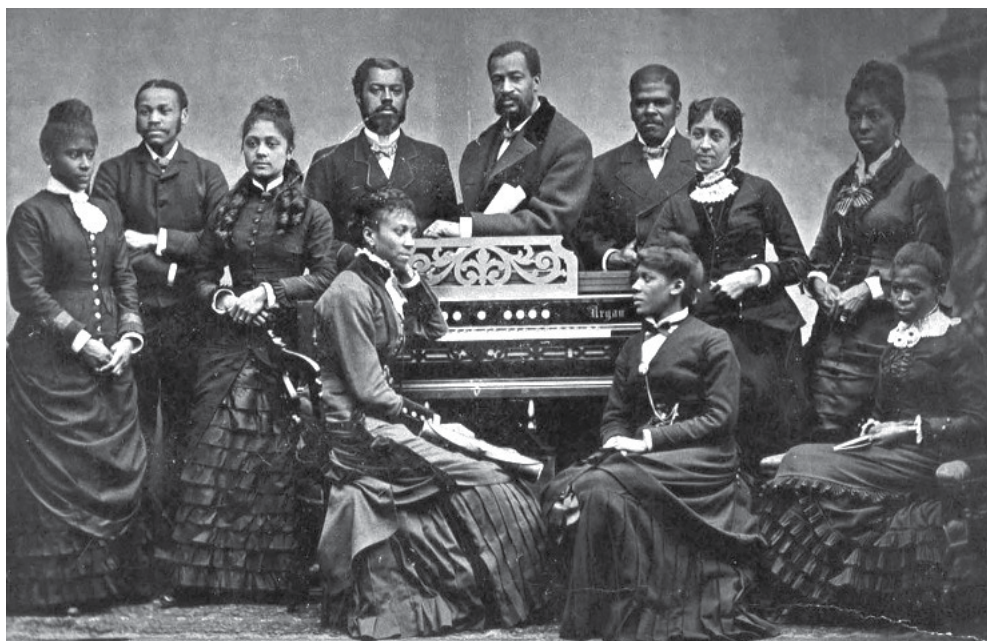
The Jubilee Singers from Fisk University, 1882.

An expansion of the mind, a connection to the heart and a curiosity into the kingdom of Negro Spirituals.