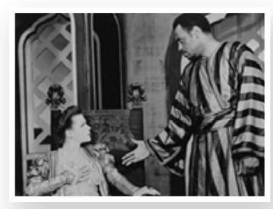
ACTOR: London debut as Joe in the American musical Show Boat/ First African American to play the role of Othello.