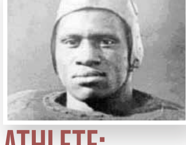
ATHLETE: All American Rutgers University Athlete/NFL Football player.