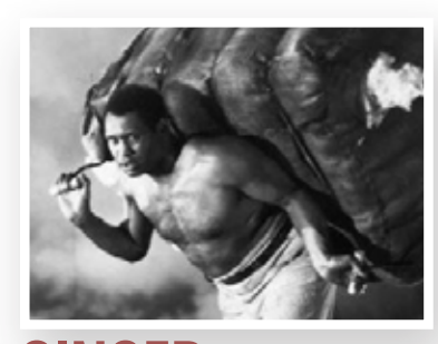
SINGER: "O'l Man River" – Show Boat (1927).