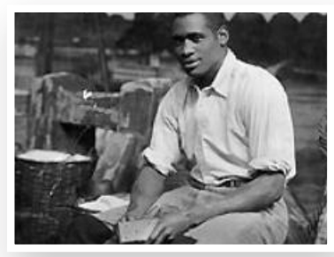
AUTHOR: Wrote Here I Stand in 1958.