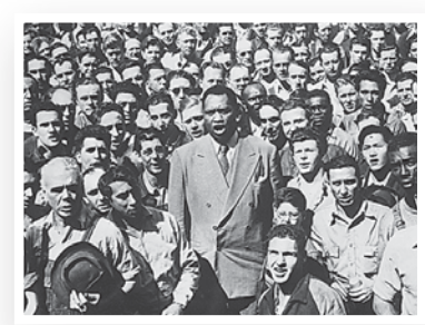
ACTIVIST: 1946 meet with President Truman to discuss lynchings of African Americans.