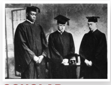
SCHOLAR: Rutgers University Valedictorian.