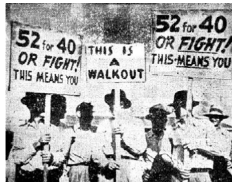
U.S. Oil Worker's Strike in 1945.