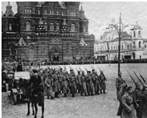
Revolutionaries march on the Red Square during the Revolution of 1917.

In January 1905, Tsar Nicholas II ordered a massacre of peaceful demonstrators outside his Winter Palace. This event, known now as Bloody Sunday, sparked many more revolts across the country. The people of Russia lived in terrible poverty. The new working class, created by the Industrial Revolution, was not satisfied with an absolute monarchy. The workers hated that they worked so hard, but the majority of the wealth in their country was held by nobles who were rich by birth.