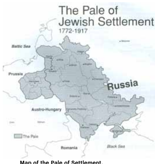
Map of the Pale of Settlement.

Teve’s village of Anatevka was based on Sholem Aleichem’s own shtetl (village). Both shtetls were part of the Pale of Settlement, a single region in Russia in which permanent residency by Jewish citizens was allowed. Outside this region, Jewish residency was generally prohibited.