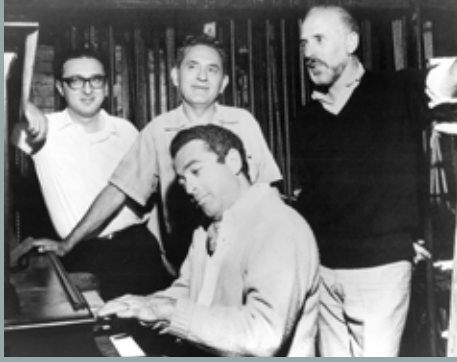
From left: Sheldon Harnick, Joseph Stein, (at piano) Jerry Bock and Jerome Robbins

In 1960 bookwriter Joseph Stein, composer Jerry Bock, and lyricist Sheldon Harnick walked into the office of Harold Prince (producer of West Side Story ) to propose a musical adaptation of Sholem Aleichem's Tevye the Milkman series.