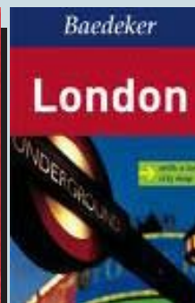
A Vintage Baedeker

In the 1950s, the most famous travel guidebook was the Baedeker. Originally published in Germany, Baedekers quickly became the go-to guides for international travelers. They highlighted art, architecture and history as well providing practical information about routes, dining and lodging. ●