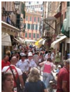
Enjoying a Passeggiata in Venice

The Light in the Piazza that you're seeing now at Arena is the chamber (small room) version of the show, and it's a perfect fit for our 460-seat Crystal City theater. For this production, Lucas and Guettel have returned to their original intent. The score is now simpler, and the orchestra is smaller. The cast, too, has shrunk, with some of the extra parts now cut.