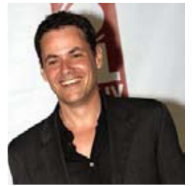
Composer and lyricist Guettel comes from a musical family. He is the grandson of Richard Rodgers ( Oklahoma! , The Sound of Music , South Pacific ) and son of Mary Rodgers ( Once upon a Mattress ).