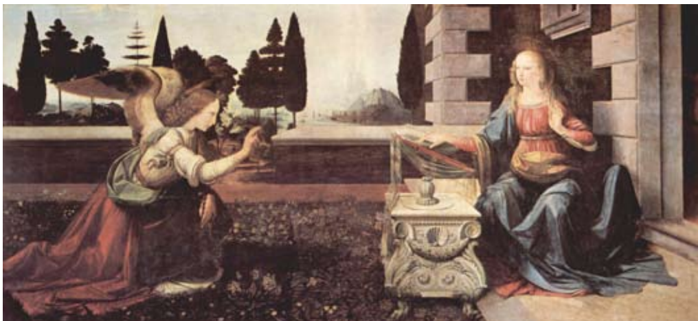
Leonardo da Vinci’s The Annunciation

I n The Light in the Piazza , Margaret and Clara encounter the work of Leonardo da Vinci (1452-1519) and Michelangelo (1475-1564), two of Italy’s most famous artists. Both men lived during the Renaissance (approx. 1400-1600), a period of cultural “rebirth” that began in Florence, Italy, and spread throughout much of Europe. Influenced by the ancient Greeks and Romans, Renaissance art celebrates the human figure in its most realistic and beautiful form. ●