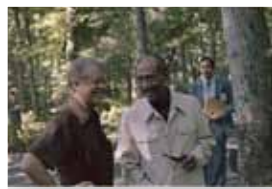
President Anwar Sadat, President Jimmy Carter and Prime Minister Menachem Begin at Camp David