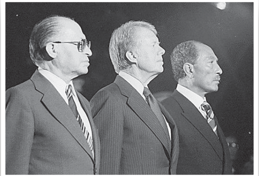
The cast of Camp David (left) recreates the famous image (right) of Menachem Begin, Jimmy Carter and Anwar Sadat.